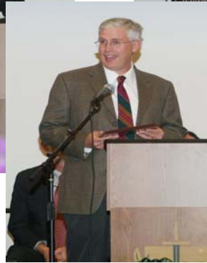
Most Improved Small Business Location Analytical Systems, Inc.